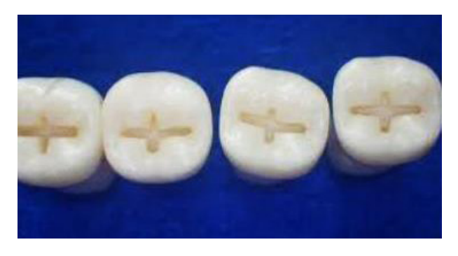
Fig. 2. Black's sidewalks- classical cavity preparation

1. Black's sidewalks/тротуары Блэка/тротуарите на Блек — The eponymous term is a dental procedure — classical cavity preparation. It is named after the founder of cavity preparation for amalgam, which has been widely used among dental professionals — Greene Vardiman Black (1836–1915), commonly known as Sir G. V. Black. He is often referred to as the "Father of Modern Dentistry", "The Teacher of Teachers". Black made a classification of carious lesions (GV Black classification) dividing them into 6 types based on their location: occlusal, buccal, lingual, gingival, tip of the teeth cusp (anteriorly, posteriorly and inter-proximally) — a classification, which is still considered as a "must-know".