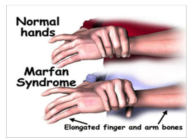
Fig. 4. Marfan syndrome (MFS)

3. the dura mater is called an arachnoid / арахноидеа/арахноидея . Scenes from the extravagant life of Olympus were woven into the canvas of Arachna — a skilled weaver who dared to compete with the goddess Athena. Provoked the gods' wrath, Arachna was turned into a spider (class Arachnida).